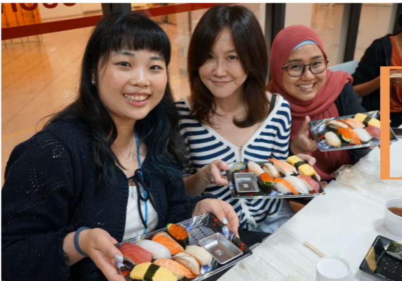
Tuesday, August 13th Making sushi experience