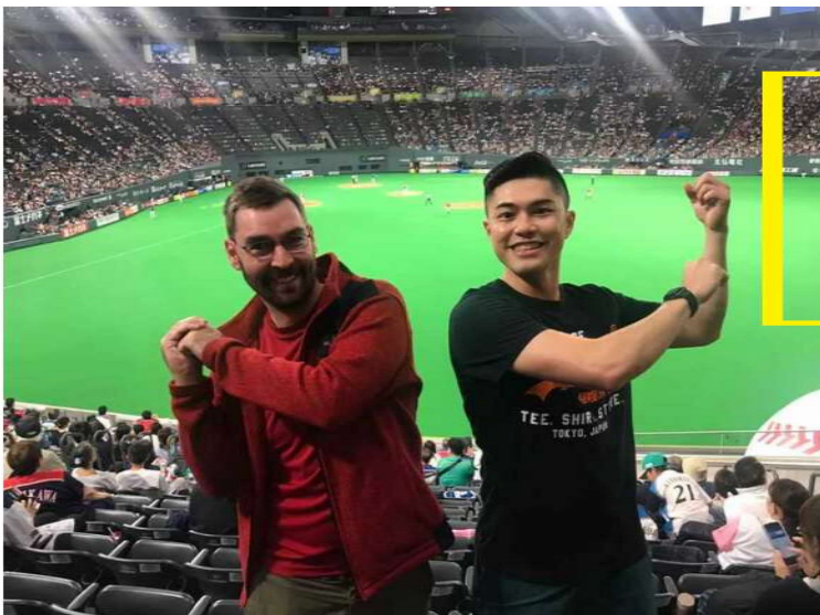
Wednesday, August 14th Watching baseball game at Nagoya dome <2,620 JPY>