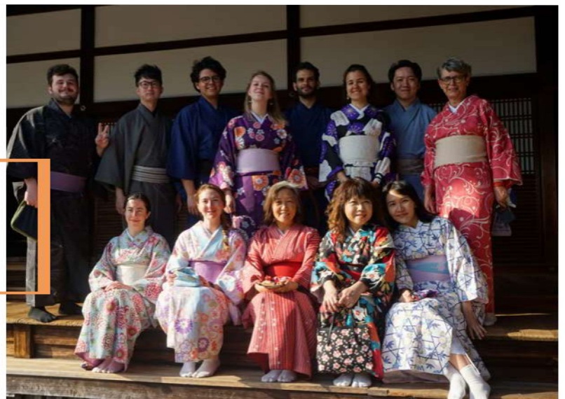
Thursday, August 8th Kimono Experience