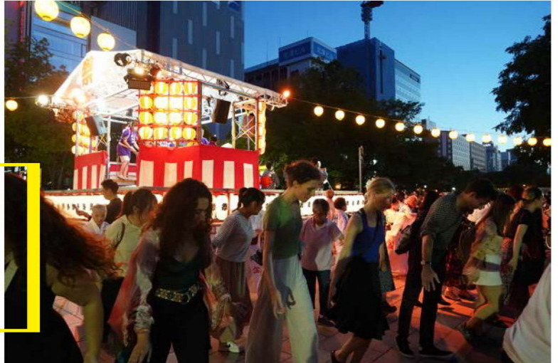
Sunday, August 11th Gujo dancing at festival Gifu prefecture <4,820 JPY>