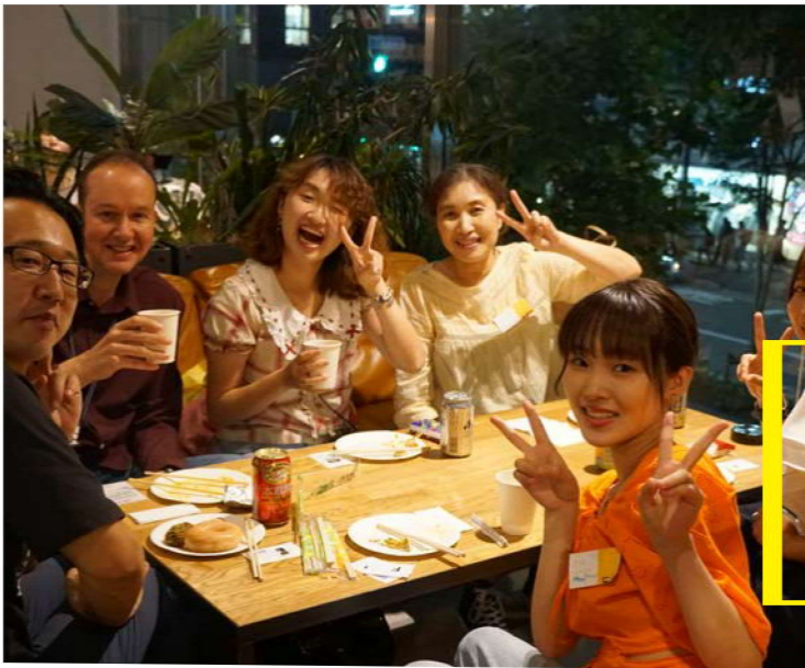
Friday, August 9th International exchange party <2,500 JPY>