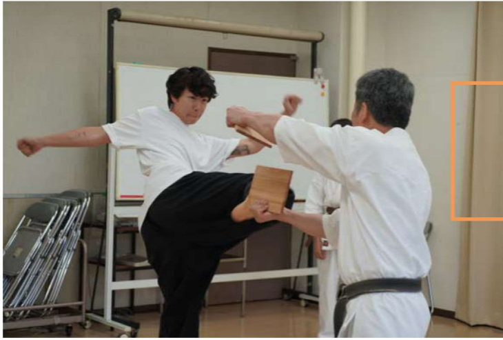
Tuesday, August 6th Karate experience